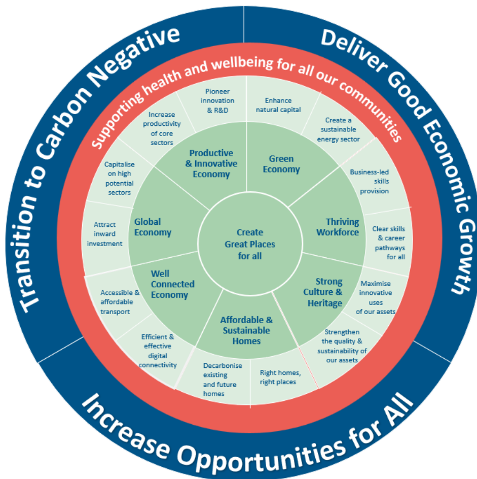
Figure 1: The Combined Authority’s Economic Framework